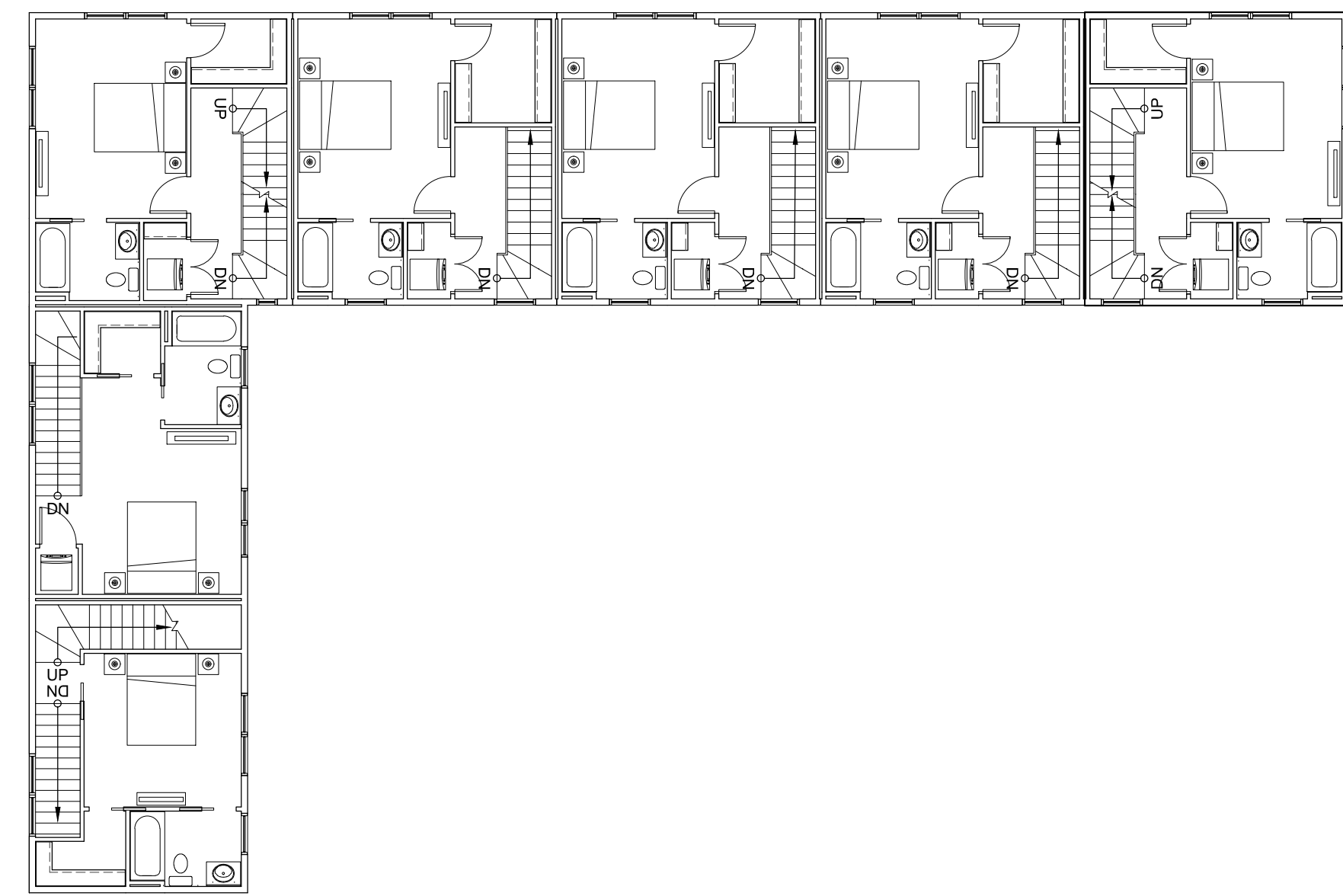
3 2ND FLOOR PLAN 3/32" = 1'-0"